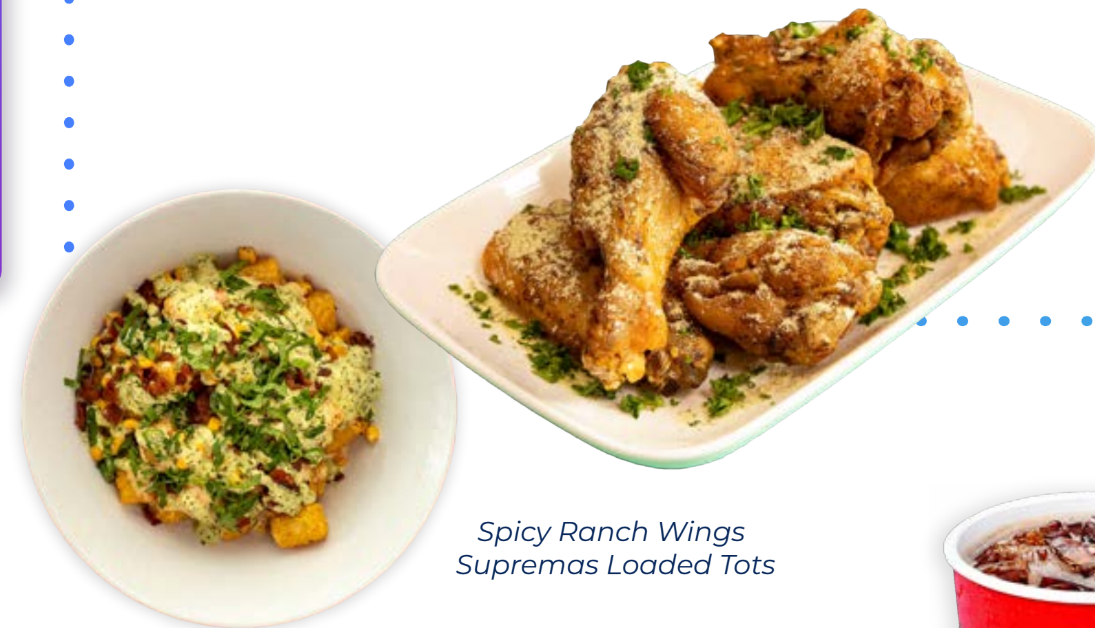
Spicy Ranch Wings Supremas Loaded Tots