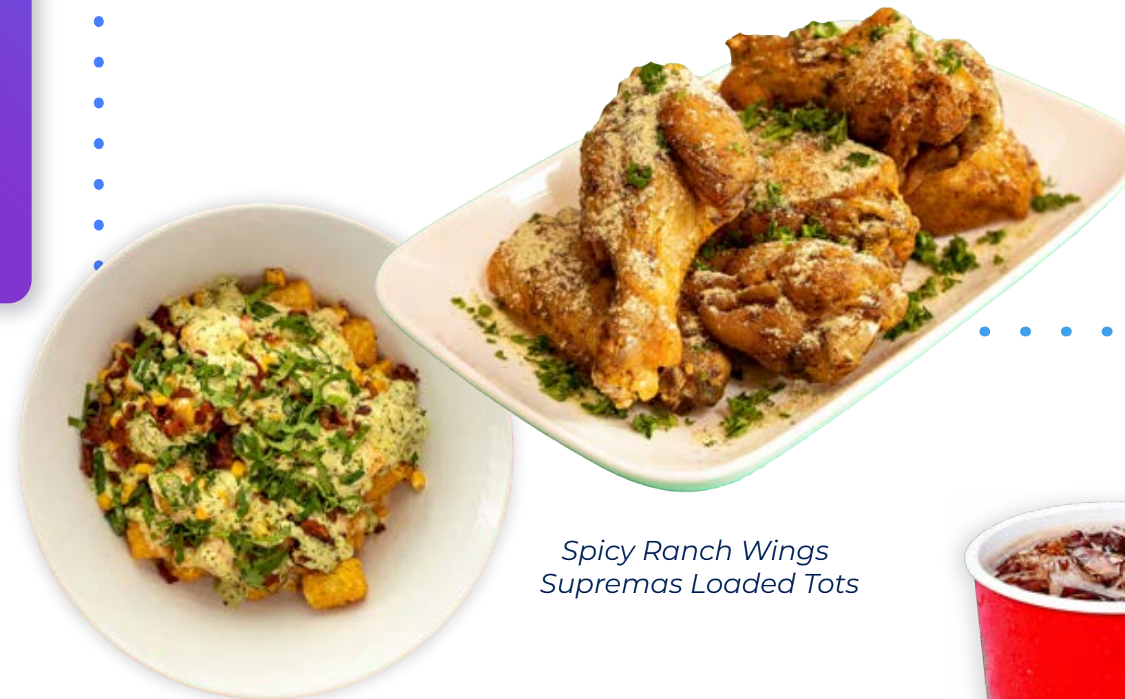
Spicy Ranch Wings Supremas Loaded Tots