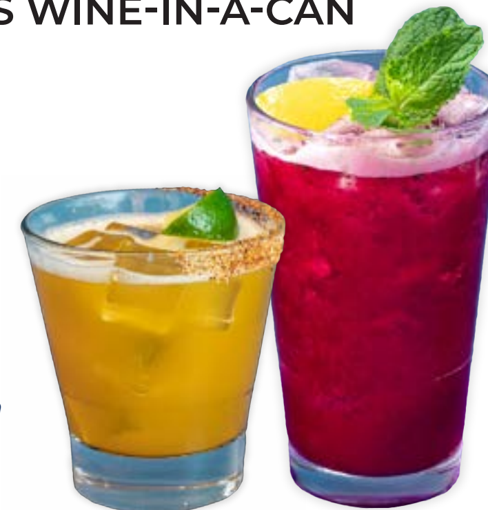
Mango 'Rita Blackberry Smash