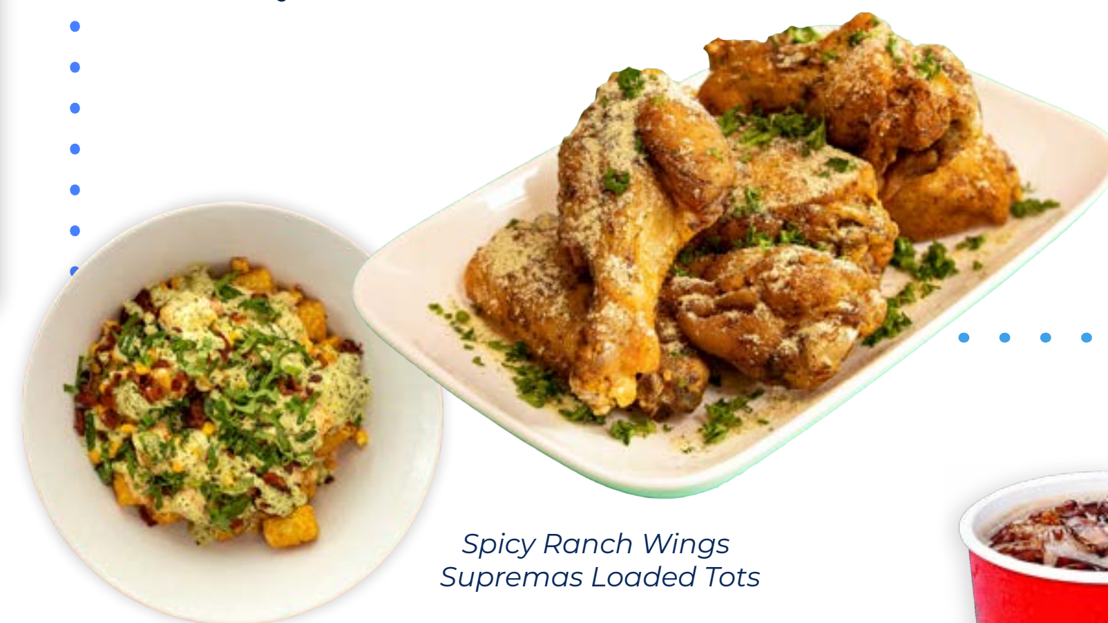
Spicy Ranch Wings Supremas Loaded Tots