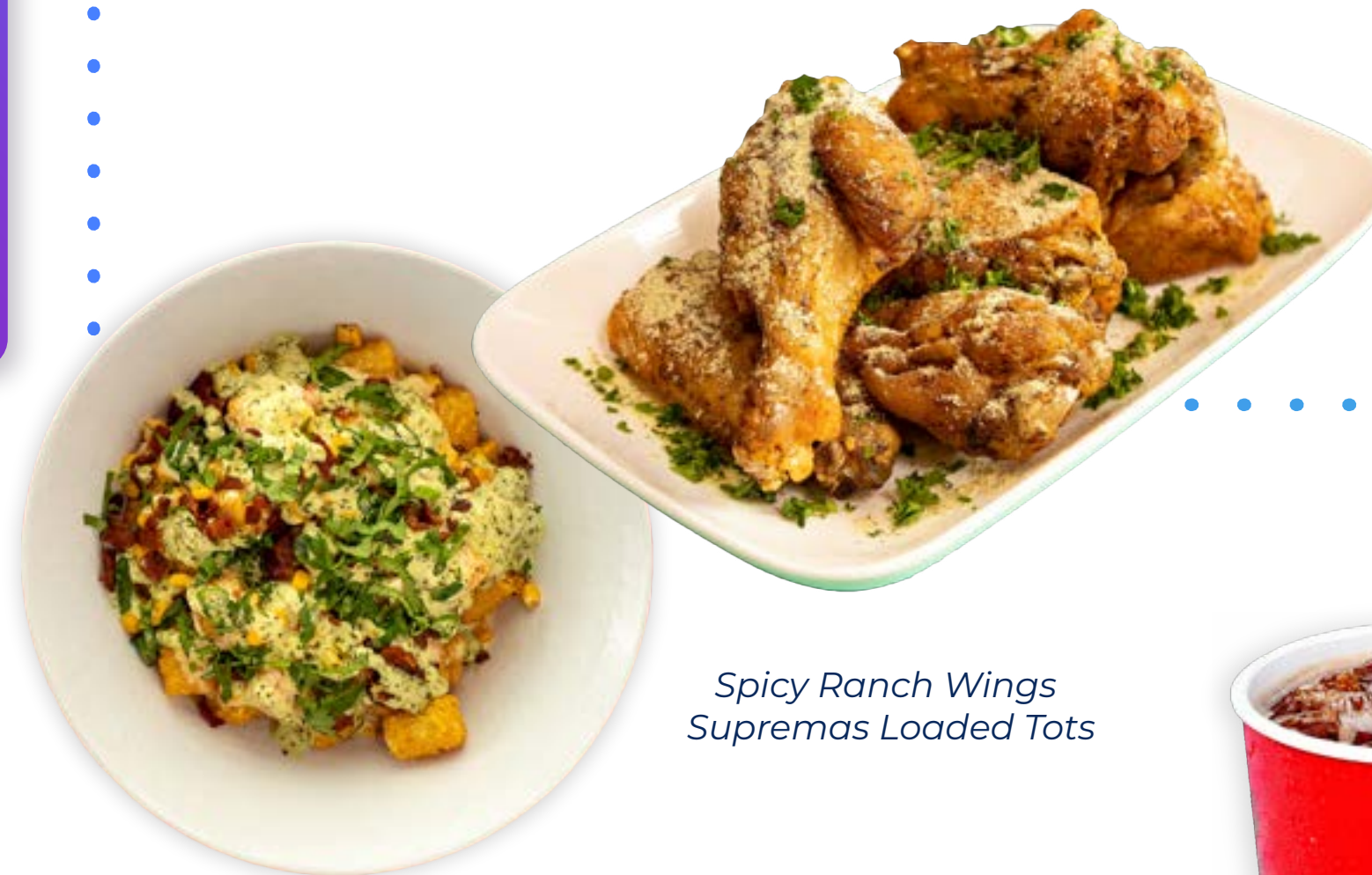
Spicy Ranch Wings Supremas Loaded Tots