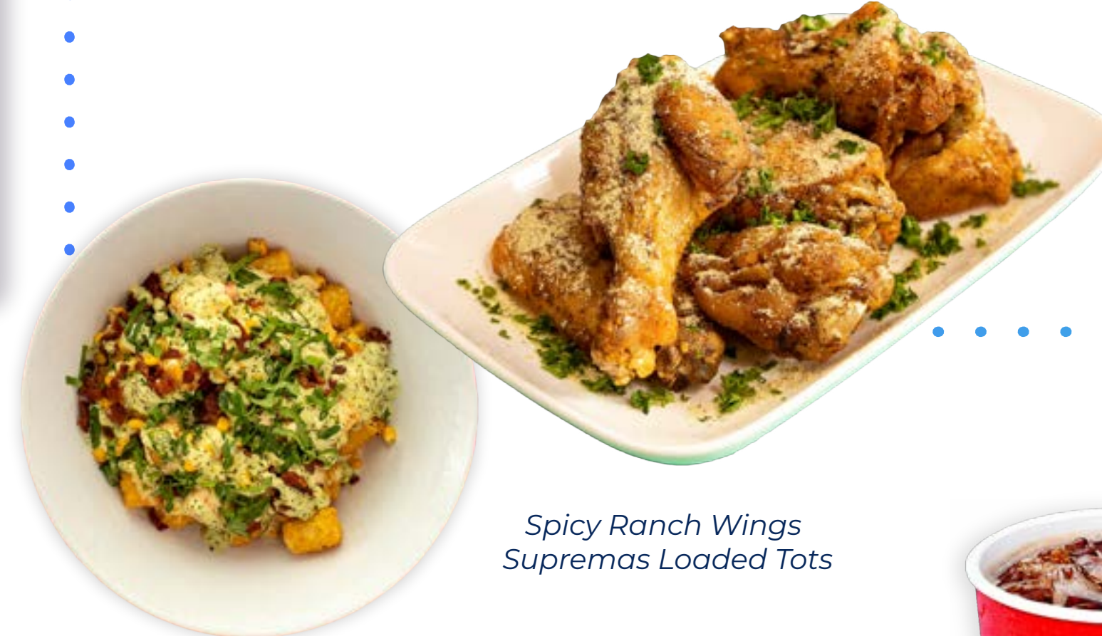
Spicy Ranch Wings Supremas Loaded Tots