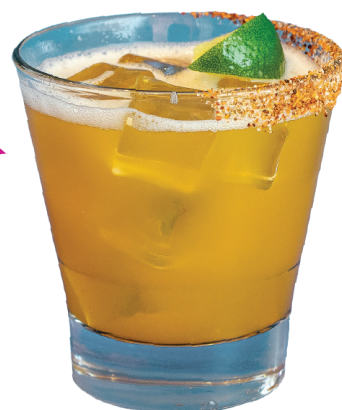
FAN FAVORITE MANGO 'RITA