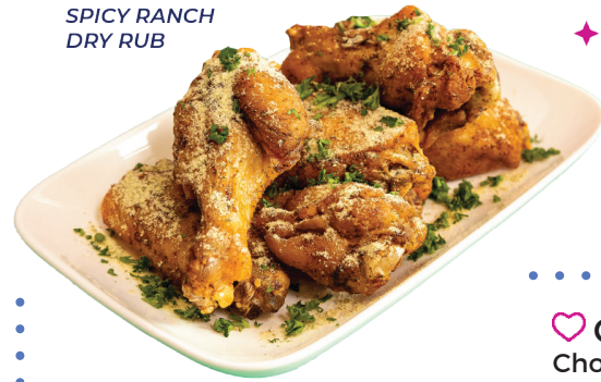
SPICY RANCH DRY RUB

Hummus, avocado, roasted tomato bruschetta, kalamata olives & basil on toasted sourdough, drizzled with olive oil. 14.5