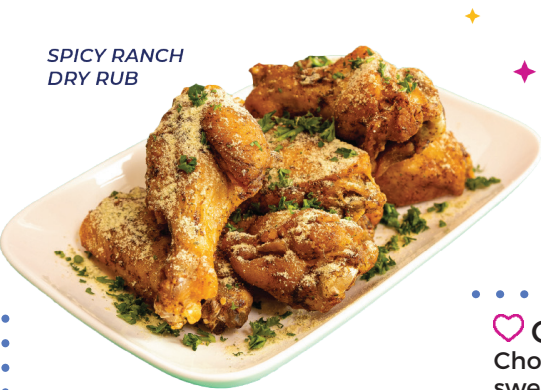
SPICY RANCH DRY RUB

Hummus, avocado, roasted tomato bruschetta, kalamata olives, & basil on toasted sourdough drizzled with olive oil.