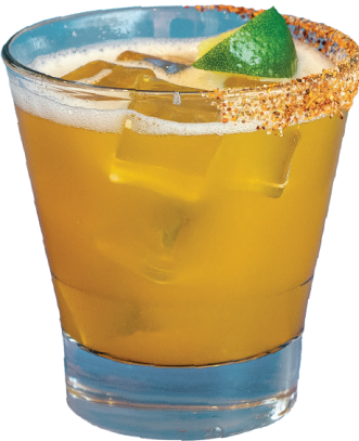
FAN FAVORITE MANGO 'RITA